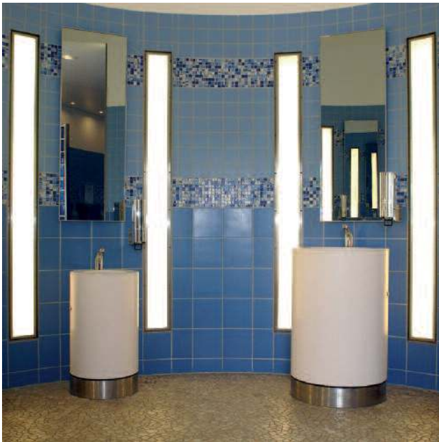
Universal application – for every joint width and all ceramic tiles.

4 When the grout is dry remove the remaining grout film with a damp sponge.