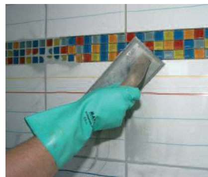
Good workability of PCI Nanofug independent from temperature.