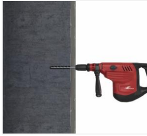
1. Drill Hole